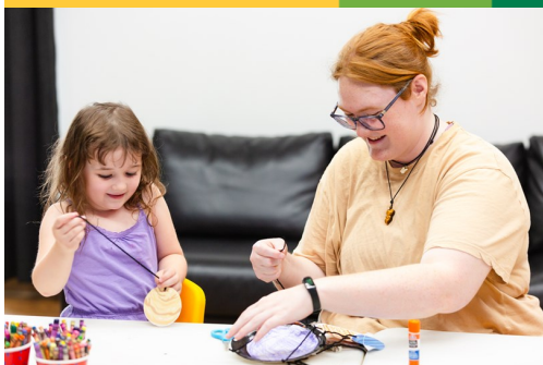
Marigold Summer Reading Program 2024